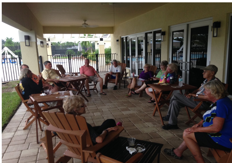
Summer Guests enjoying happy hour on the patio

The summer season is over and fall is here! The weather will soon turn cool up north, but not here! The pool and spa look great. The covered areas on the shuffle board courts have been completed and new windscreens on the pickleball and tennis courts have been installed and are ready for players. A new gate is being installed between the courts to make retrieving those errant shots a little easier.